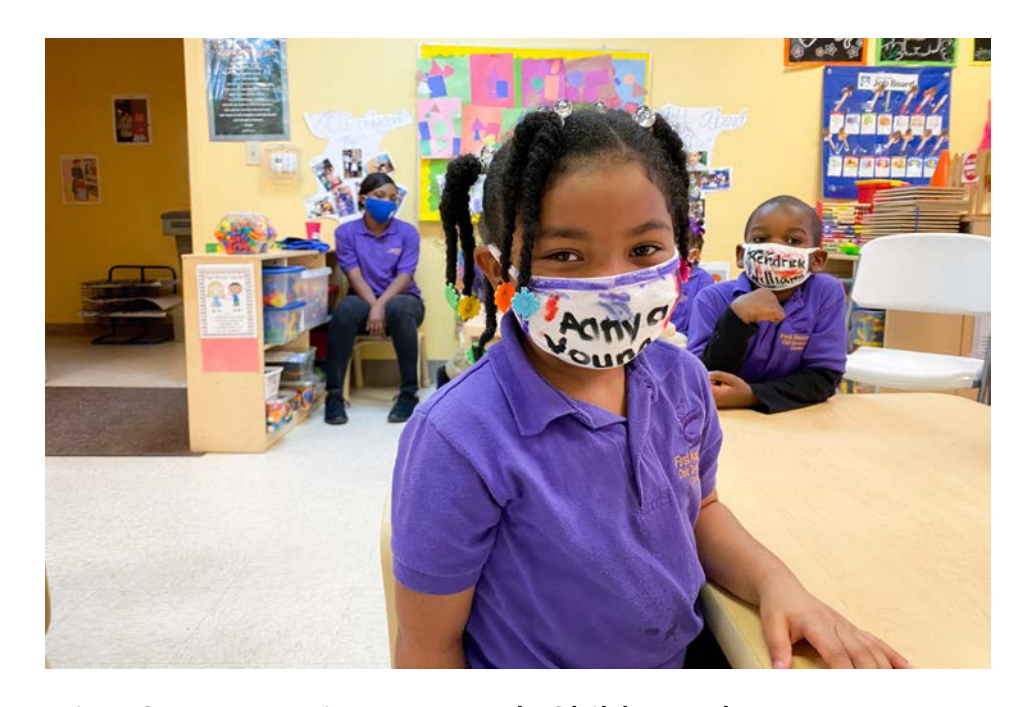
First Steps 4K, First Nazareth Child Development Center, Columbia